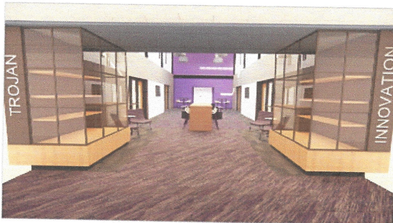
Conceptual rendering of the High School collaboration area.