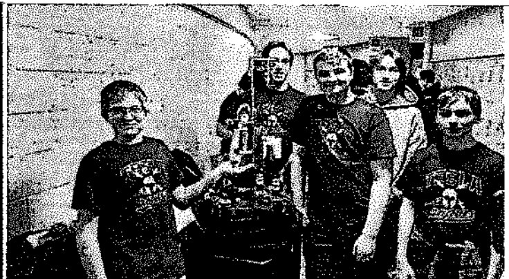
Congratulations to the Tesla Trojans robotics team and the Dodgeland Academic Decathlon team.